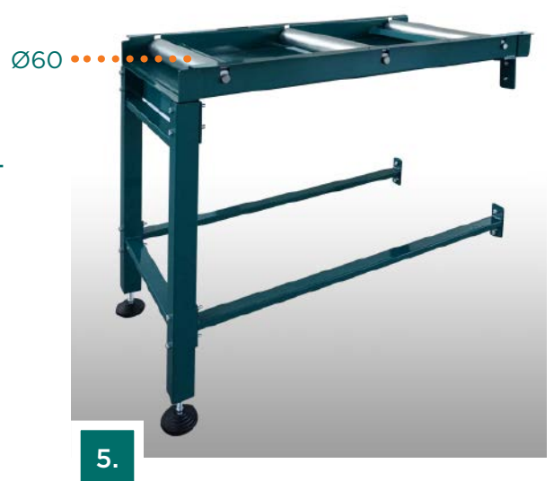
Roller unit type "B"