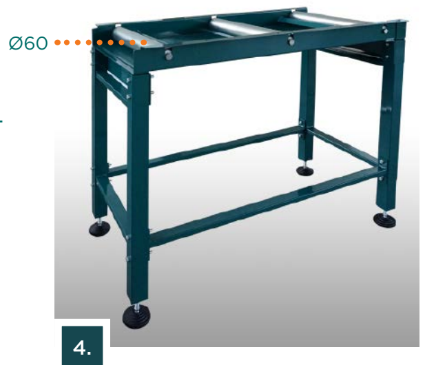
Roller unit type "A"