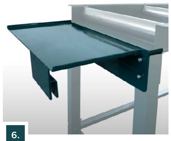
Plan type "C"